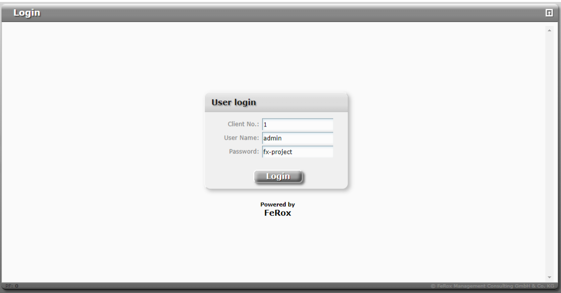
(Illustration 4: The screenshot may differ depending on the version)