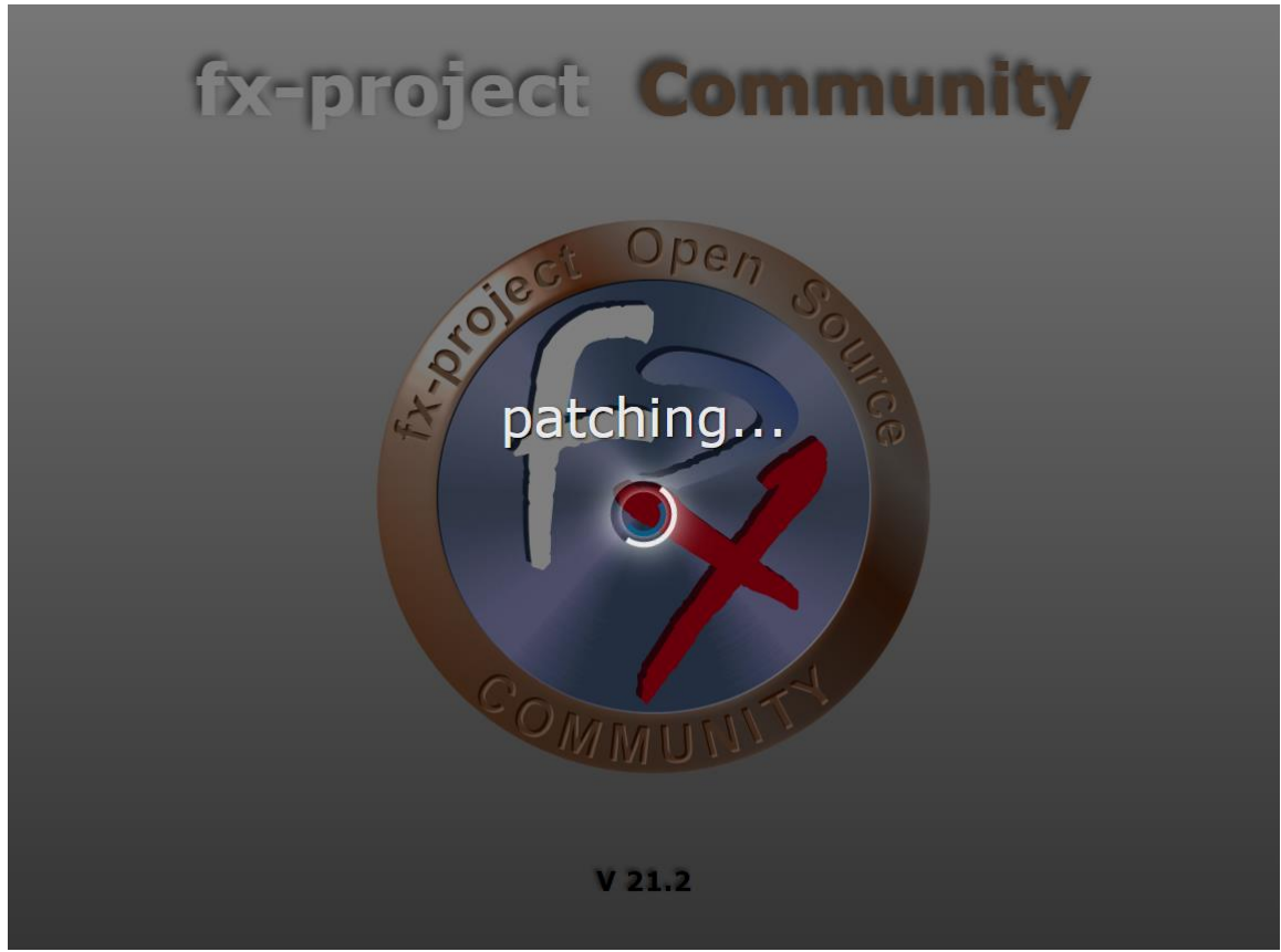
(Illustration 3: The screenshot may differ depending on the version)

The necessary database changes are made.